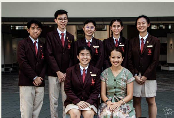
Extended Council Attache Committee (ECACo)