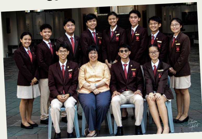
Socials and Relations Committee (SnR)