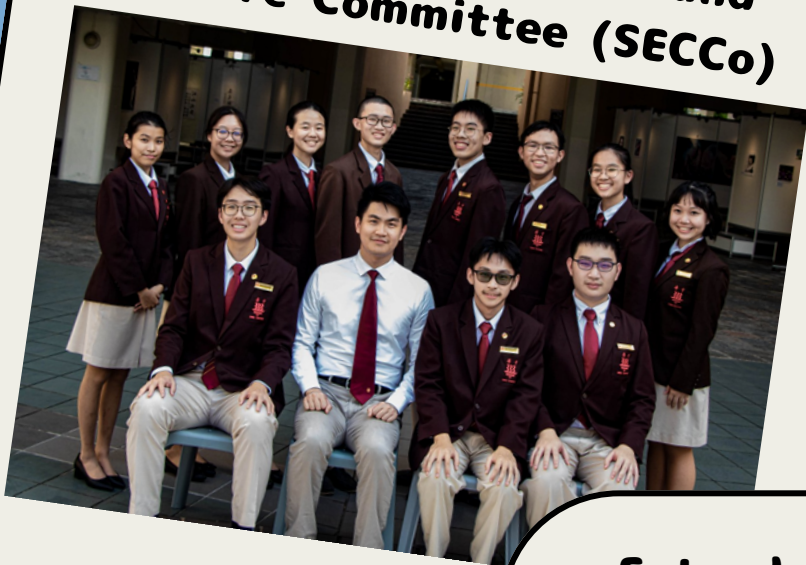
Student Engagement and Culture Committee (SECCo)

Each of the Standing Committees takes charge of an important aspect of the Council's job scope. Every Councillor will have a post in one of the Standing Committees and will work in that job scope for his/her entire year in Council.