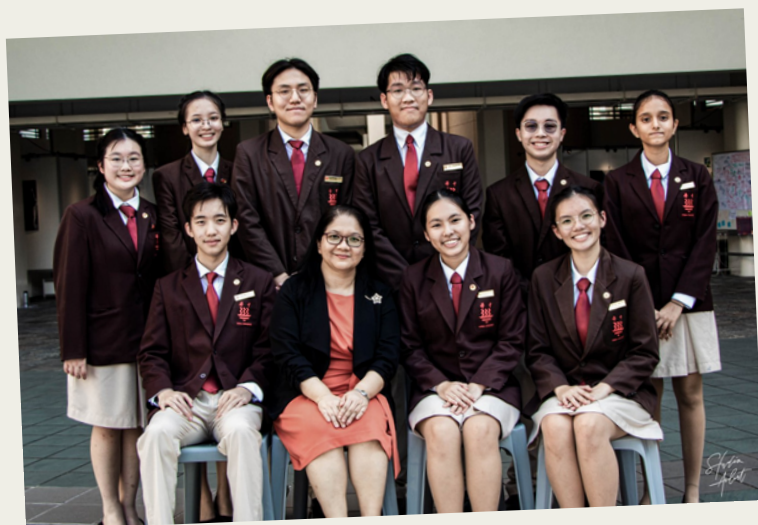
Welfare Committee (WelCo)